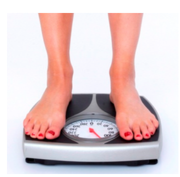
HAPPY LOSERS (WEIGHT LOSS GROUP)

Come...enjoy the smiles of success Be...supported in your weight loss journey